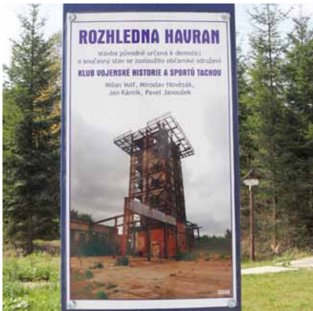
Figure 4b Information panels in the bottom part of the Havran tower