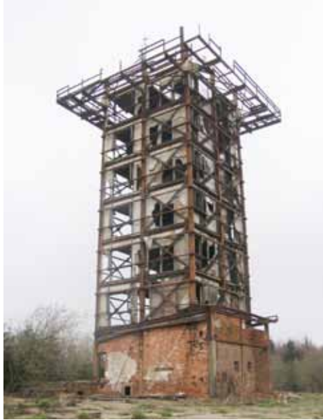
Figure 2 Ruins of Havran in May 2013 shortly before the renovation