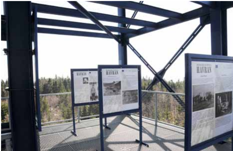
Figure 5 Exhibition in the Havran tower