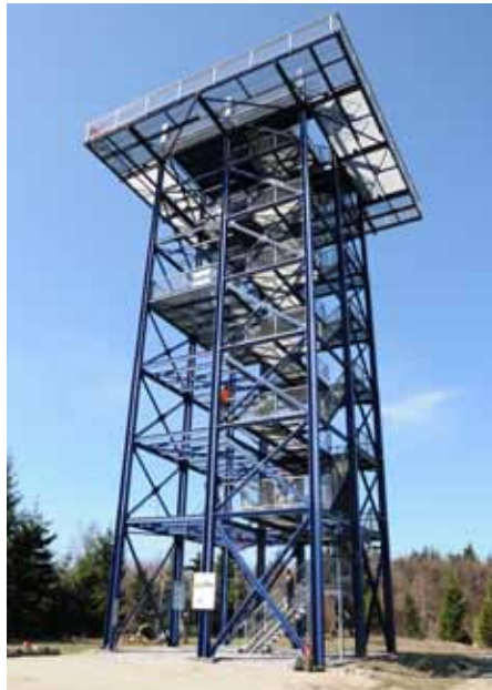
Figure 3 Havran lookout tower in March 2019