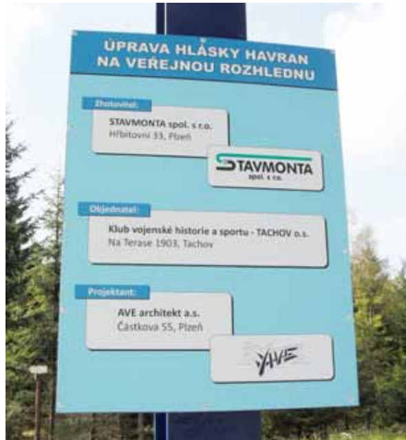
Figure 4c Information panels in the bottom part of the Havran tower