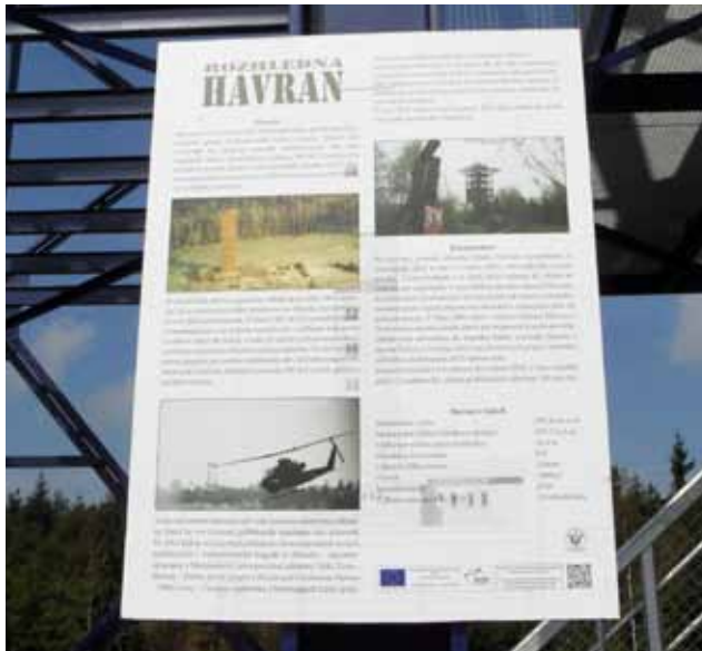
Figure 4a Information panels in the bottom part of the Havran tower